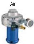
Air motor (M6X) shown with ball valve and muffler.

Electric motors are available in 110V or 220V, Single Phase, 50-60 Hz. All are equipped with 12 ft. (336 cm) cord, circuit breaker with manual reset, internal cooling fan, and built-in on/off switch. Motors are rated continuous duty.