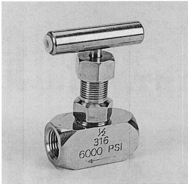
908 Series Needle Valve 1/4" - 1"