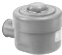
E20 & E58

G20 (20 watt coil) and G58 (58 watt coil): General purpose solenoid enclosures have pressed steel housings epoxy coated for general purpose NEMA-1 applications – indoors and where atmospheric conditions are not a problem.