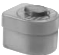
G20 & G58

W20 (20 watt coil): Water and dust-tight polyester solenoid enclosures are part of the coil and are completely molded. They meet NEMA-4X requirements for indoor and outdoor service and are both water and dust-tight, and suited for corrosive atmospheres compatible with polyester and nylon. Valve pictured on front of this brochure is shown with W20 coils. The coils come standard with an unlighted 1/2" NPT female external connector assembly. This type of connector allows internal electrical connection to be made easily while disconnected from the coil. The external cable connection to the housing may be arranged at any one of the 4 angles (90° increments) to facilitate valve installation. A connector assembly can also be ordered with an optional indicator light which shows when the solenoid is energized. The connector meets DIN 43650 Form A.